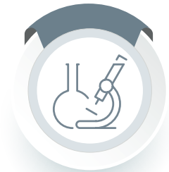
Pharmaceuticals Industrial UV