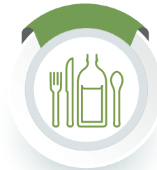
Food & Beverage Industrial UV